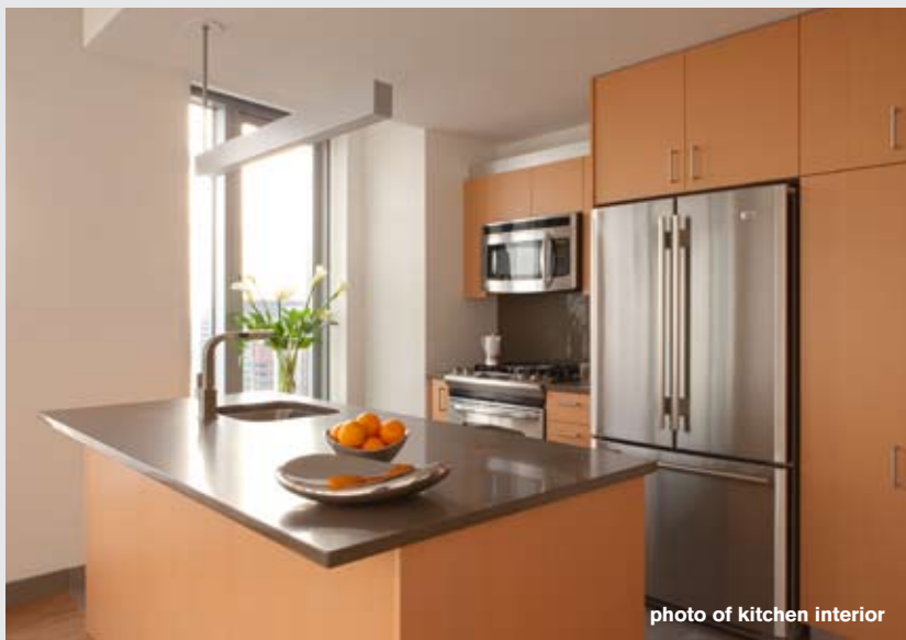
photo of kitchen interior