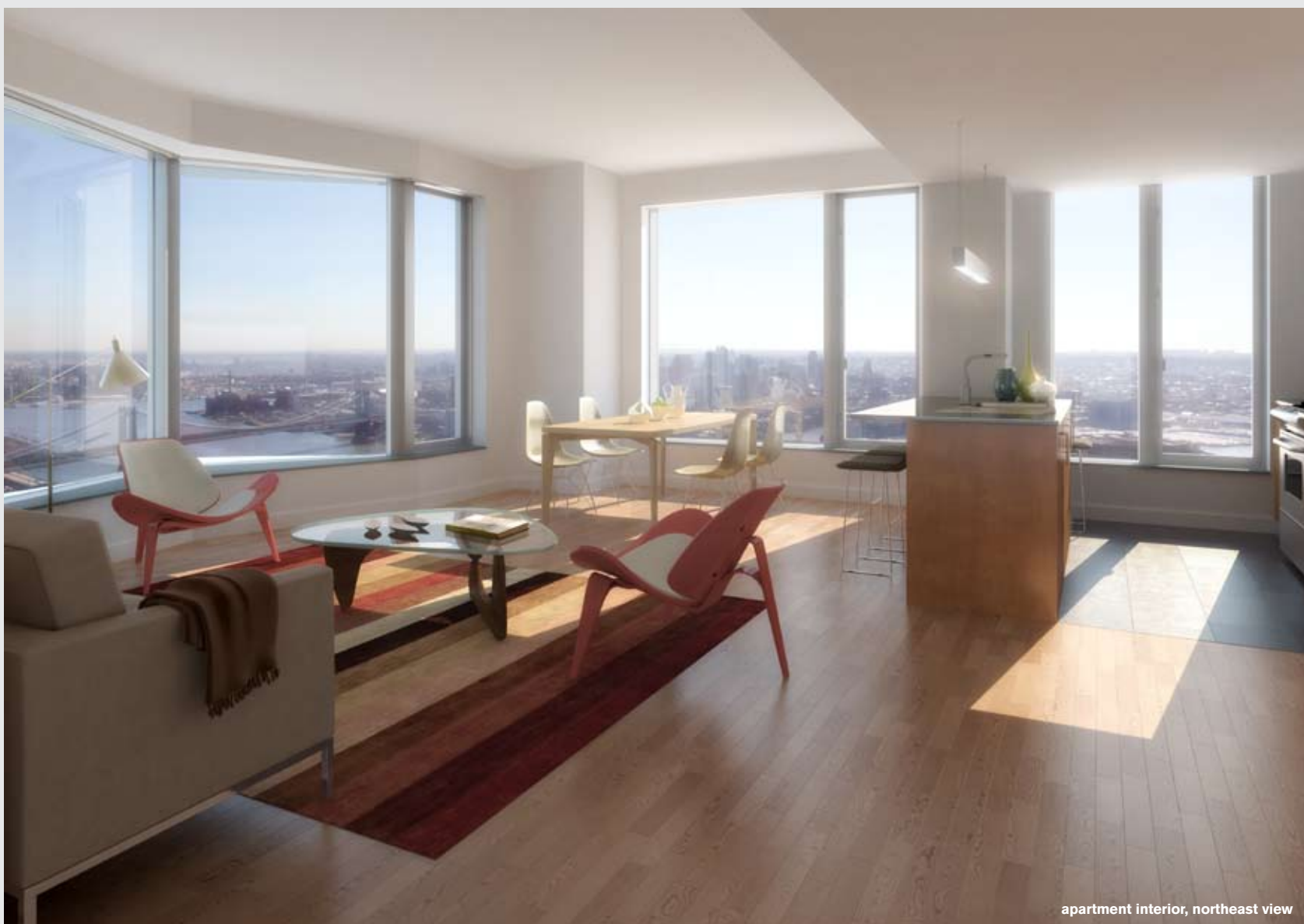
apartment interior, northeast view