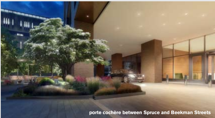
porte cochère between Spruce and Beekman Streets

It was Gehry's innovative approach to the incorporation of bay windows that created the building's dynamic silhouette and an exceptional variety of panoramic views from its residences. By shifting the bay windows from floor-to-floor and tailoring their configuration for each residence, Gehry has given residents the opportunity to, as he puts it, "step into space." The exterior impact of the bay window design solution is that the building appears to be draped in fabric, an effect accentuated in Gehry's shaping of the façade's stainless steel cladding. In addition to providing sculptural intrigue, the vertical arcs of bay windows reflect the changing light, transforming the appearance of the building throughout the day.