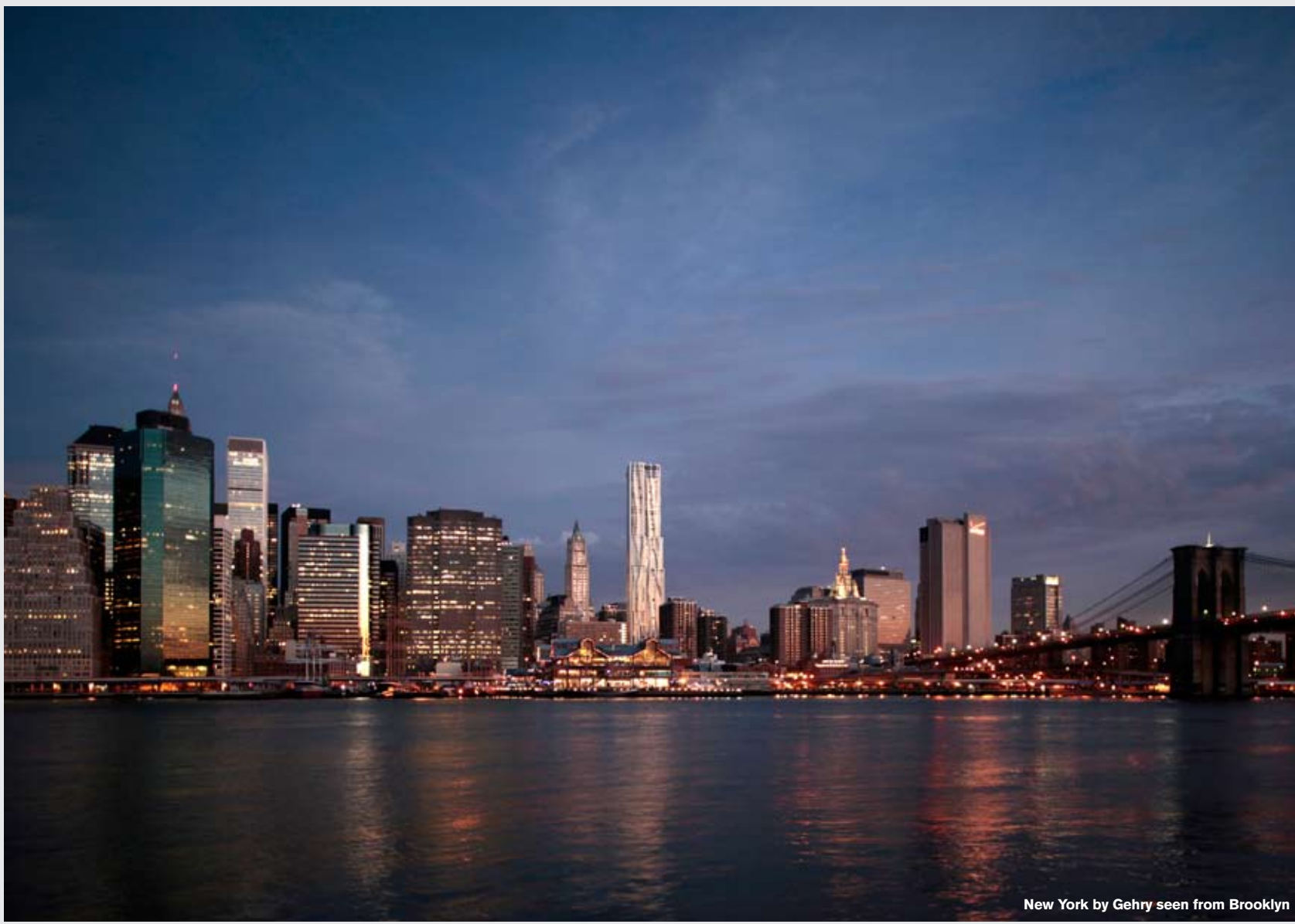
New York by Gehry seen from Brooklyn