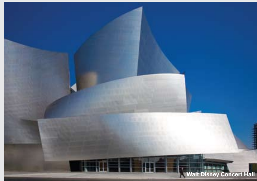
Walt Disney Concert Hall

Over the past five decades, under Gehry's creative direction, Gehry Partners, LLP has designed public and private buildings in North America, Europe, and Asia. Hallmarks of Gehry's work include a particular focus on creating spaces that are comfortable to the people who use them, and that exist well within the larger context and culture of their location. The firm's approach to design is one in which the client becomes fully engaged in the process, making each project a true collaboration.