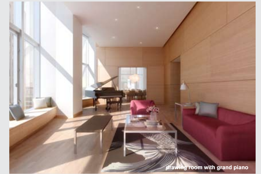
drawing room with grand piano

Residents enter New York by Gehry via a porte cochère between Spruce and Beekman Streets that fronts an 11,500 square-foot plaza. In the lobby, a custom Frank Gehry designed sculptural concierge desk resonates with the fluidity of the building's architectural style and complements the lobby's honey-colored vertical grain Douglas Fir walls.