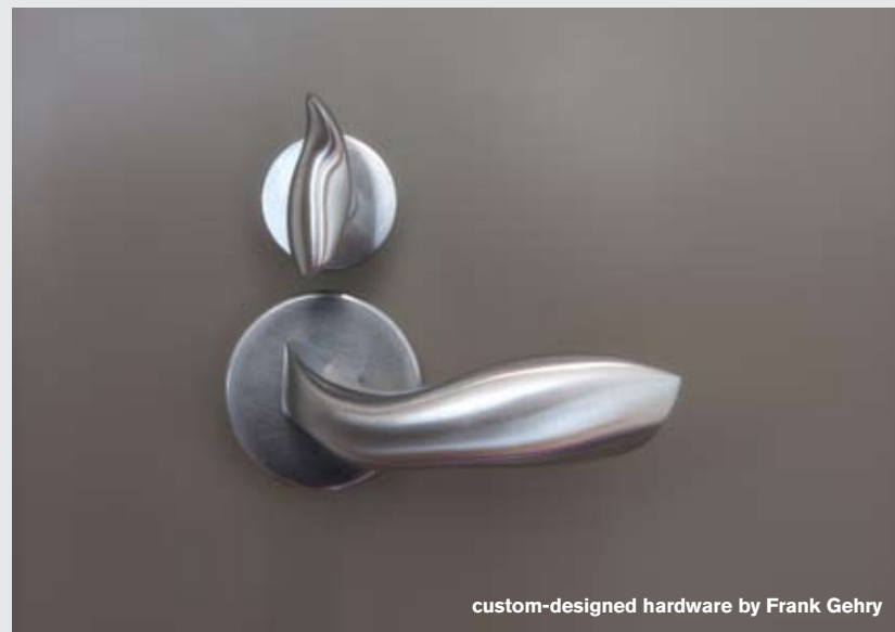
custom-designed hardware by Frank Gehry

Gehry's design resulted in over 200 unique floor plans that bring the drama of the dynamic exterior wall movement into residents' private spaces. Where the façade undulates, the residential windows also move into the apex of the folds, creating free-form bay windows that are fitted with seating or left open to accommodate dining or reading niches. All interior finishes and fixtures have been selected by Gehry, including cabinetry crafted in his signature honey-colored vertical grain Douglas Fir. In addition, Gehry designed sculptural residential entry door handles and hardware exclusively for New York by Gehry inspired by organic forms and movement. All residences are finished with white oak flooring, fitted with solar shades that offer privacy while preserving views, and outfitted with stainless steel appliances and individual washer/dryer units. Building-wide features include water filtration, individually controlled vertical heating and cooling units, and large picture windows throughout to maximize views.