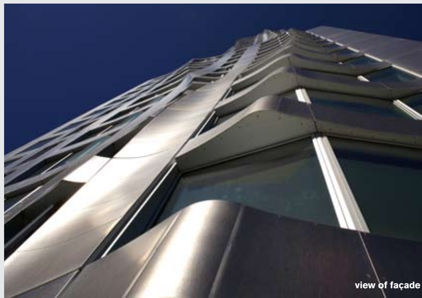
view of façade

Set just north of Manhattan's Financial District near the Brooklyn Bridge, New York by Gehry is located at the center of a variety of dynamic neighborhoods, including Tribeca, Chinatown, and the South Street Seaport. A dozen nearby subway lines provide easy access to all areas of New York City.