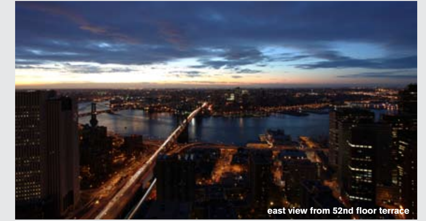
east view from 52nd floor terrace

New York by Gehry is a transformative and singularly identifiable addition to the New York skyline that greets travelers as they land at regional airports and arrive via bridges across the Hudson and East Rivers. Views from every perspective and each floor, at all times of the day and throughout the year, are limitless. Intimate perspectives of the Woolworth Building to the west are set against a breathtaking panorama that encompasses the Hudson River's piers and parks. All five East River bridges and iconic midtown skyscrapers, including the Empire State and Chrysler buildings, unfold in front of the eastern and northern exposures. Views toward the northern horizon include Central Park and the George Washington Bridge. To the south and east, Manhattan is seen against the backdrop of the New York Harbor and the Atlantic Ocean.