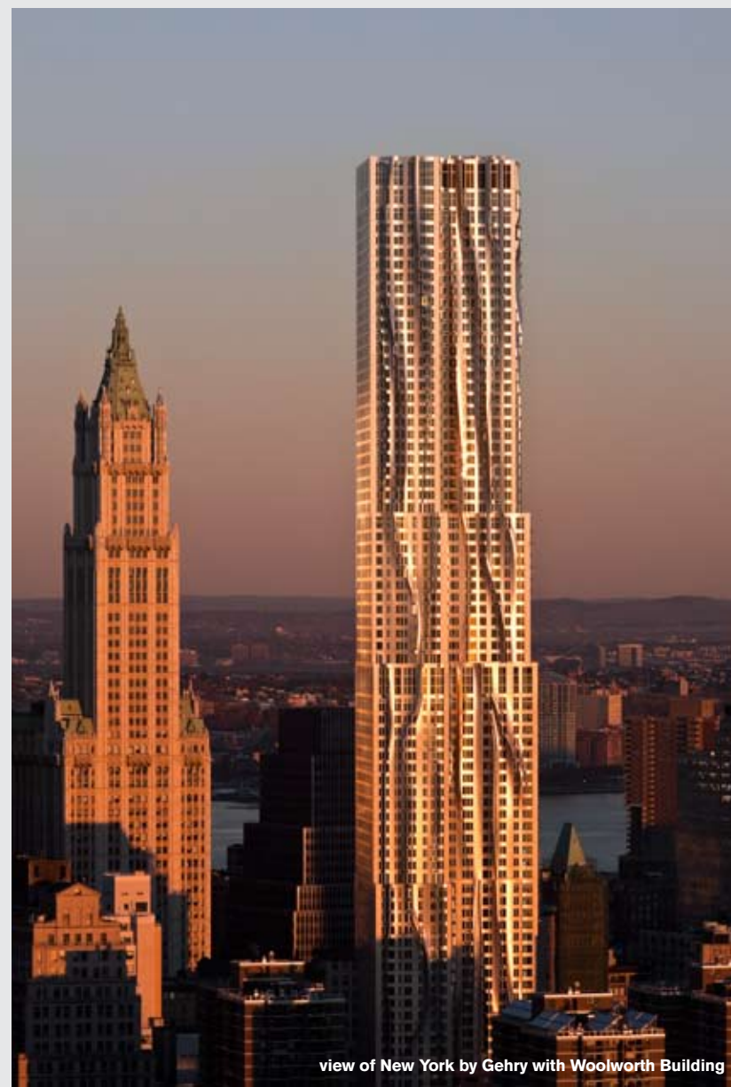
view of New York by Gehry with Woolworth Building