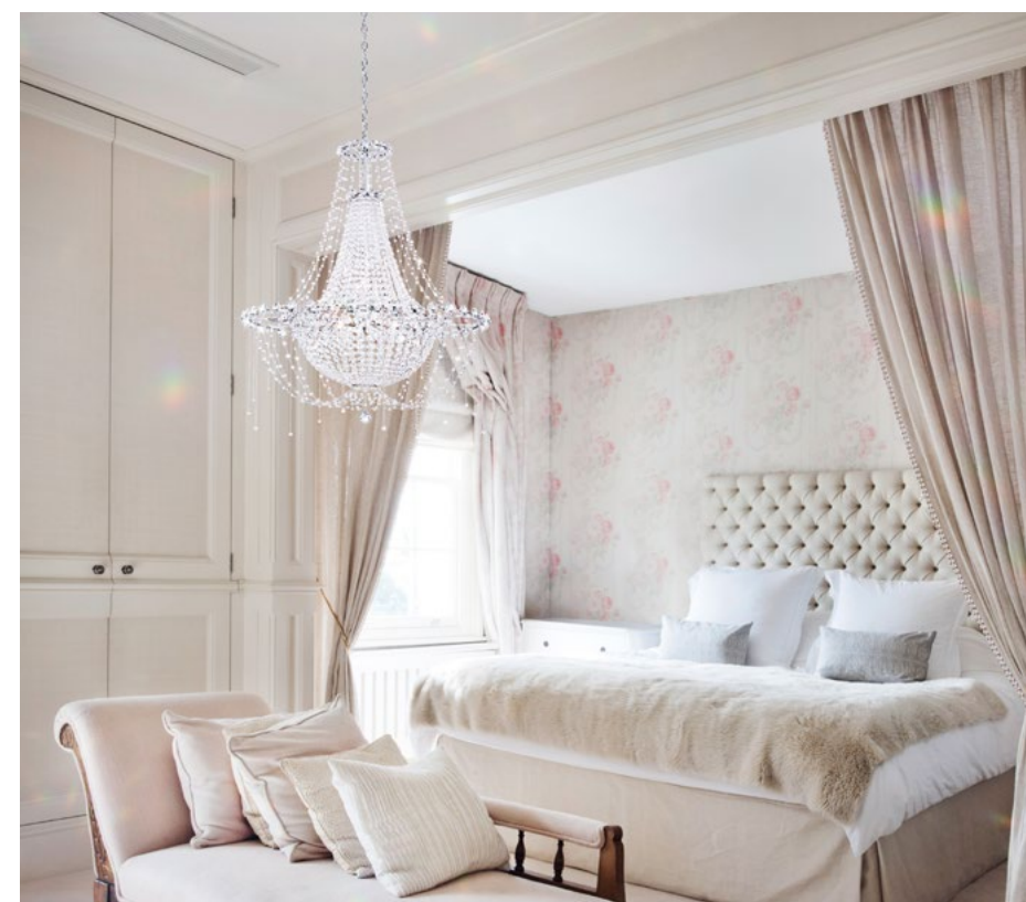
Collection American Traditional Product Line Chrysalita Core CM8334-401A

Inspired by history, culture, and the natural world, Schonbek’s American Traditional Collection is richly detailed and often ornate. Decorative elements speak to Schonbek’s heritage of craftsmanship and may recall the extravagant gestures of neo-Baroque architecture or the delicate textures and patterns of a formal garden. With sensitivity to the timeless aspects of art and nature, pieces from this collection can easily join family heirlooms in classical homes or serve as standout statement pieces in modern or eclectic interiors.