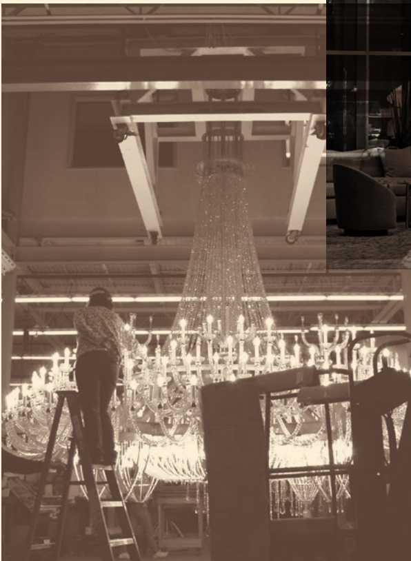
Schonbek Behind The Scenes

Sometimes, the lightest touch can be the most impactful. With a subtle adjustment – perhaps to the color of crystals or the choice of trim – a fixture you really like is instantly transformed into one you absolutely love. Most of the fixtures in Schonbek’s American Traditional, American Romantic, American Rustic, and American Contemporary collections can be personalized with changes to finish, trim, and color. Our design and engineering team carefully reviews personalization requests to ensure that the proposed changes can be implemented successfully and result in a beautiful fixture that performs flawlessly.