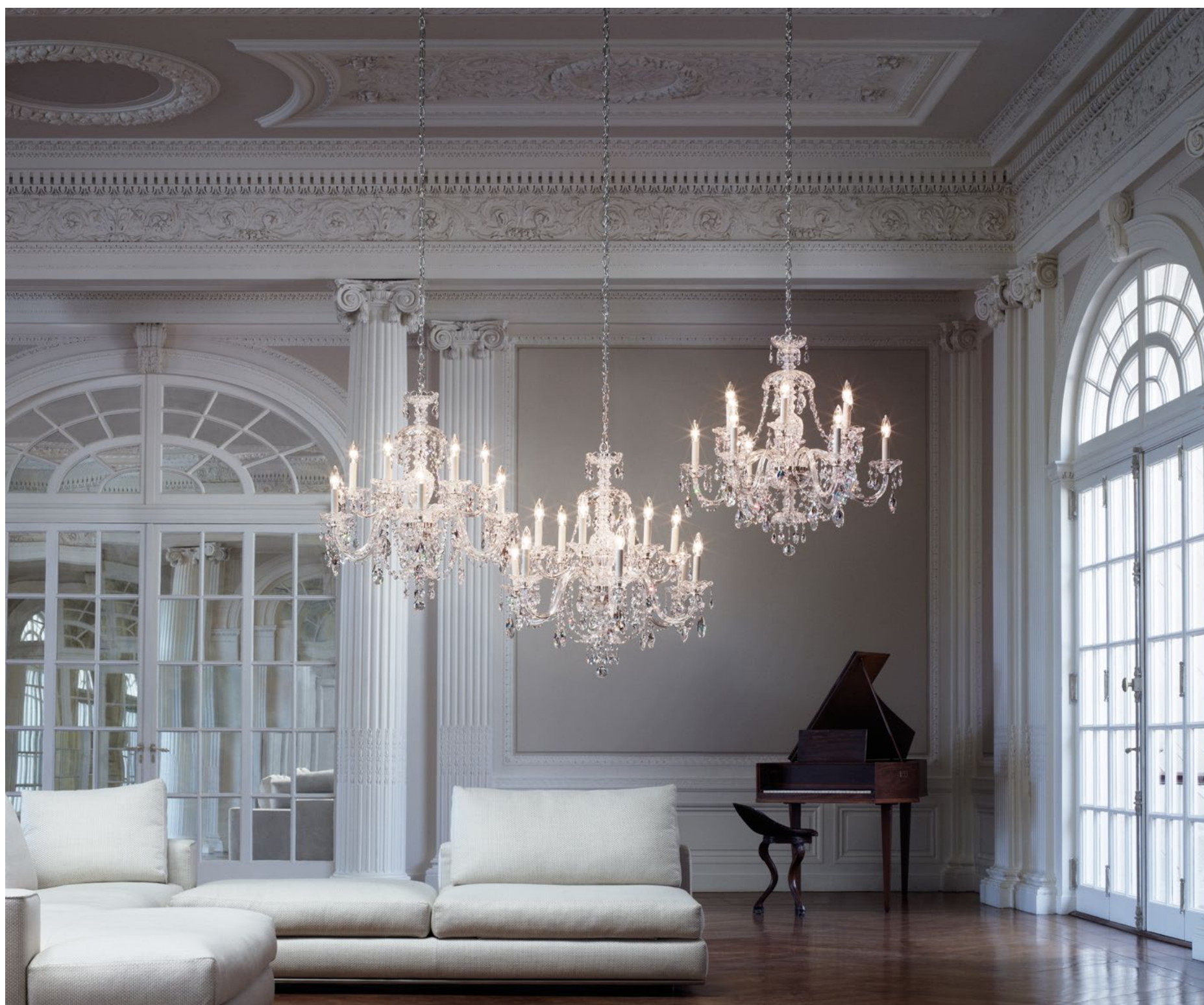
Collection American Traditional Product Line Sterling Core 3601-40S

Schonbek showcases another breakthrough as it unveils a new method of gluing crystals together. This innovative technique allowed for the creation of previously unthought-of chandelier designs, including Trilliane, which was released in 1992. To date, Schonbek is responsible for nearly 200 patents.