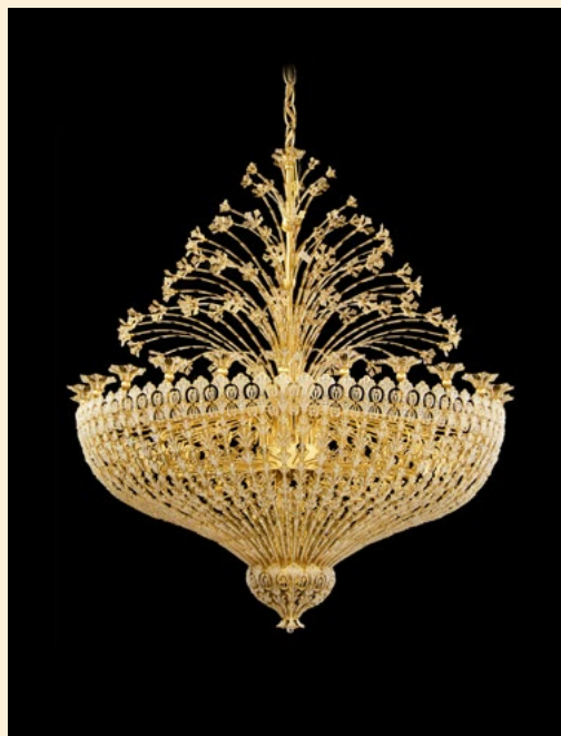
Tailored Rivendell 7884 77"(196cm) x 88"(224cm)

Our team’s passion for lighting and vast expertise shines with custom engagements. We work in close collaboration with industry professionals and individual customers throughout a process that progresses through a series of steps, including conceptualization, refinement, design, engineering, manufacturing, and installation. As needed or desired, Schonbek can tap into resources available through an established network of partners utilized by the Swarovski group or may bring in outside lighting designers with a specialization or point of view that is particularly important for a project. Certain custom designs may also involve mood boards, mockups, or architectural renderings. Mindful of the complexity of lighting, the design-development phase of custom engagements involves our engineering team, who ensure that the proposed design can be successfully produced and will perform up to Schonbek’s exacting standards of excellence.