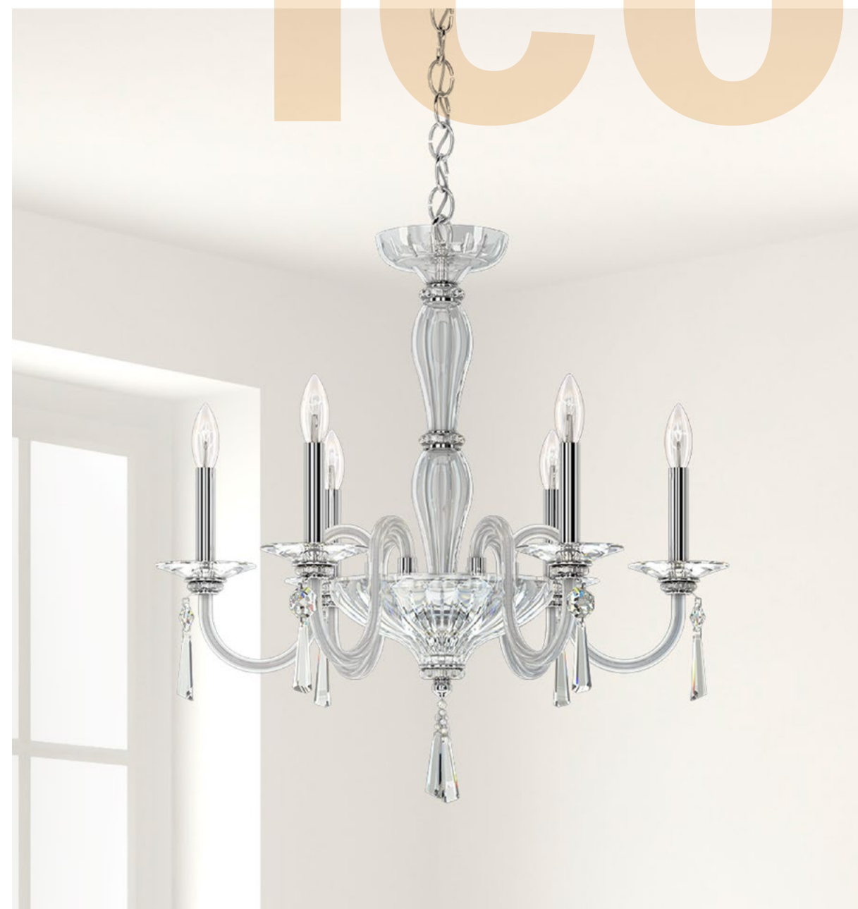
Collection American Traditional Product Line Savannah Core CF1006-B40