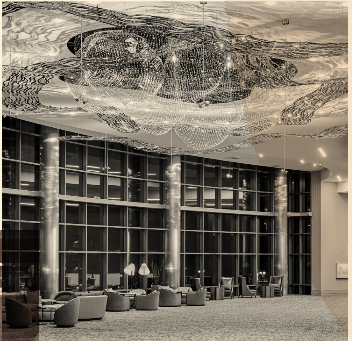
San Diego Marriot

For lighting to make the exact impression you seek – whether grand or subtle – it must be perfectly proportioned for the space it occupies. With Schonbek’s tailoring services, our design team increases or decreases the size of a fixture, drawing on the extensive library of custom sizes we have previously built for each product line or designing a new size, if needed. For tailoring to be successful and maintain the design integrity of the fixture, all elements must be produced to accommodate the new size, including glass arms, column pieces, bobeches, and crystals. Tailoring also enables customers to specify crystal size, shape, and color variations.