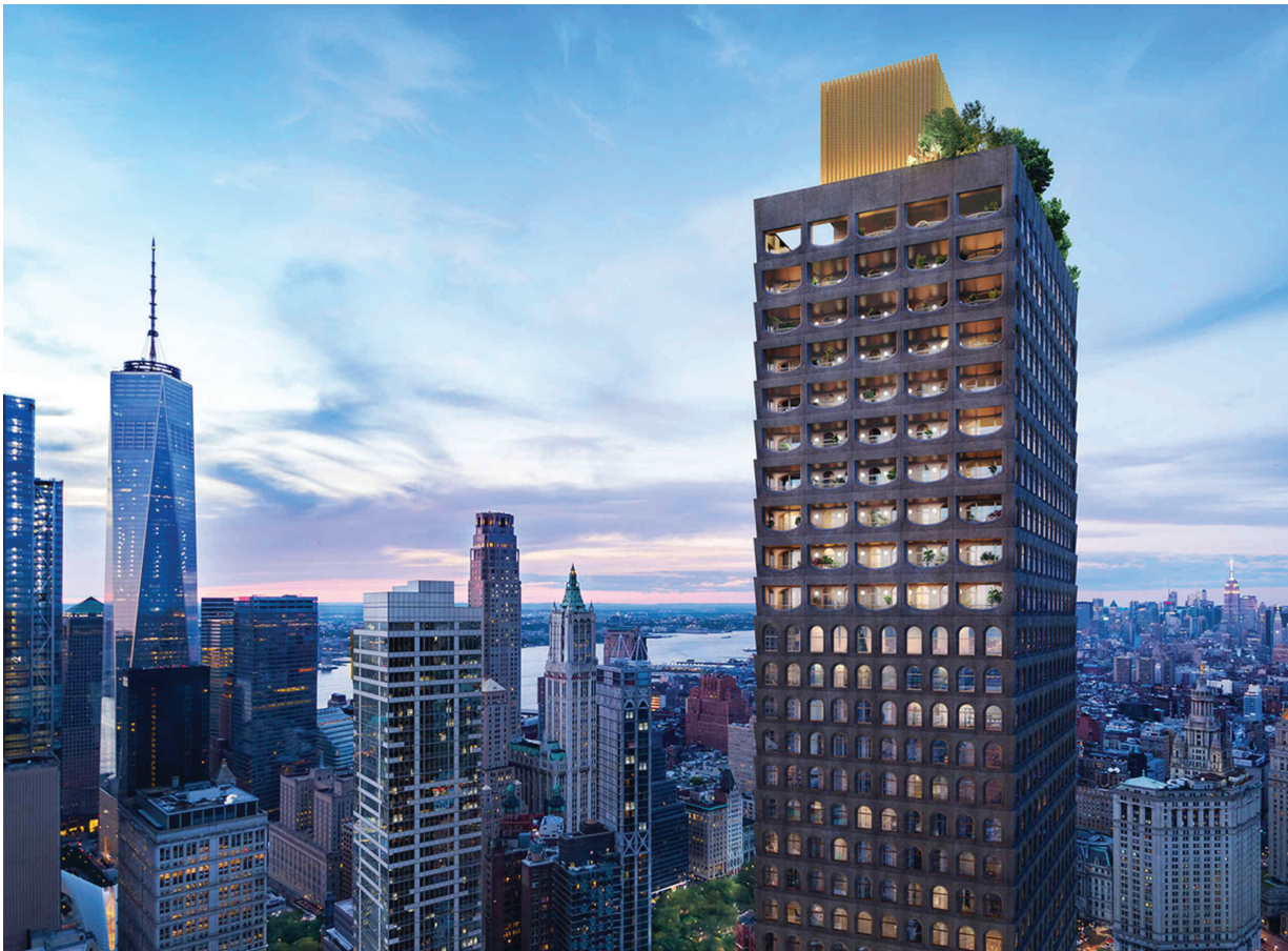
Manhattan living illuminated by the most cinematic skyline in the world