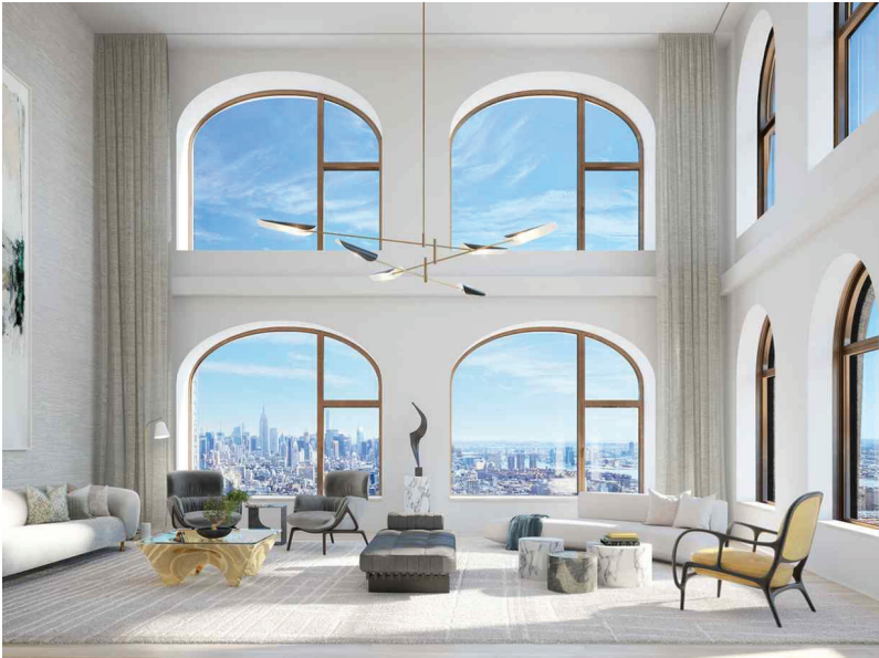
Double-height living rooms feature approximately 19ft ceilings with views framed by oversized arch windows that help to maximise natural light

With sales only recently launched, over 40 contracts signed in less than 40 days on the market, and an inquiry list that already exceeds 3,000 and continues to grow, 130 William appears to be the most successful condominium in Manhattan's notoriously competitive market. Achieving such a strong position is attributable to many factors, not least its thoroughly original and truly luxurious design.